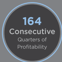
Over 40 Years