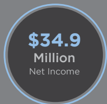
Highest in CVBF History

President & Chief Executive Officer CVB Financial Corp., Citizens Business Bank